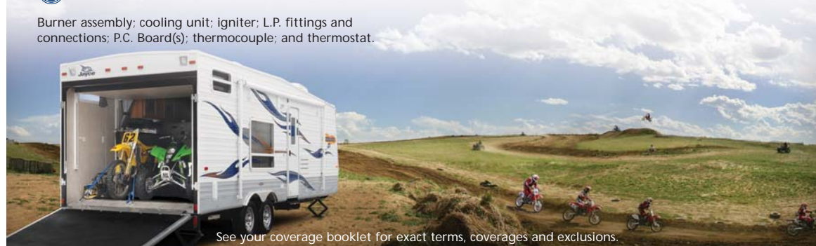
See your coverage booklet for exact terms, coverages and exclusions.

regulator, valves and range bi-fold cover (metal only), refrigerator 110 volt heat element; rear garage door system; reverse osmosis water system; roof horn system, roof TV antenna and head, manual or automated rotators, mercury switch, elevating gear (metal only), interior metal crank; safe; satellite radio; satellite system; security systems (factory installed); shore cord retractor; shower head, shower pan, shower stall, outside shower system (metal only); slide tray arm; sleep number beds; solar cells; solar panels; sub floor and basement compartment gas struts (worn or weak), suspension shackles; swing hitch; tire pressure monitor; TV (any size); TV antenna (factory installed); two-piece shower enclosures; water heater orifice, DSI, control valve, re-ignitor, pressure relief valve; water purifier (metal only), hot water dispenser (metal only), water lines and fittings (metal only), drain valves and manifold tube (metal only), lines (metal only), on/off valve (metal only); weather center (factory installed); and Web TV (factory installed).